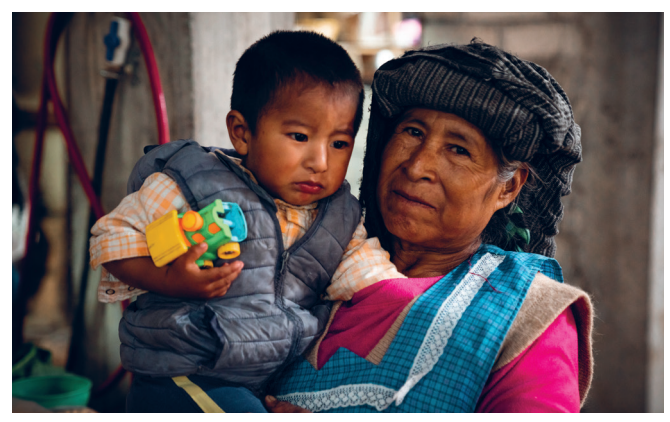
Church members from Mexico.

The patron saint of Mexico, also the country's national symbol, is Virgin of Guadalupe. Additionally, cities, towns and villages also hold as patron of their locale a Roman Catholic saint. Unified devotion to these saints is considered integral to receiving favors and prosperity for a healthy community, thereby ensuring the need for and importance of maintaining religious uniformity.<sup>6</sup> Stereotyping and negative attitudes towards religious diversity is prevalent across a large part of Mexico<sup>7</sup>, making religious beliefs the second most frequent ground for discrimination.<sup>8</sup> Non-Roman Catholic faith adherents such as Protestant Christians often find themselves deprived of the right to basic services such as water, education, electricity, health services, use of cemeteries, grocery stores, dispossession of real property or, as the case may be, illegal deprivation of liberty, while living in majority religious communities. There is seldom any support from the government