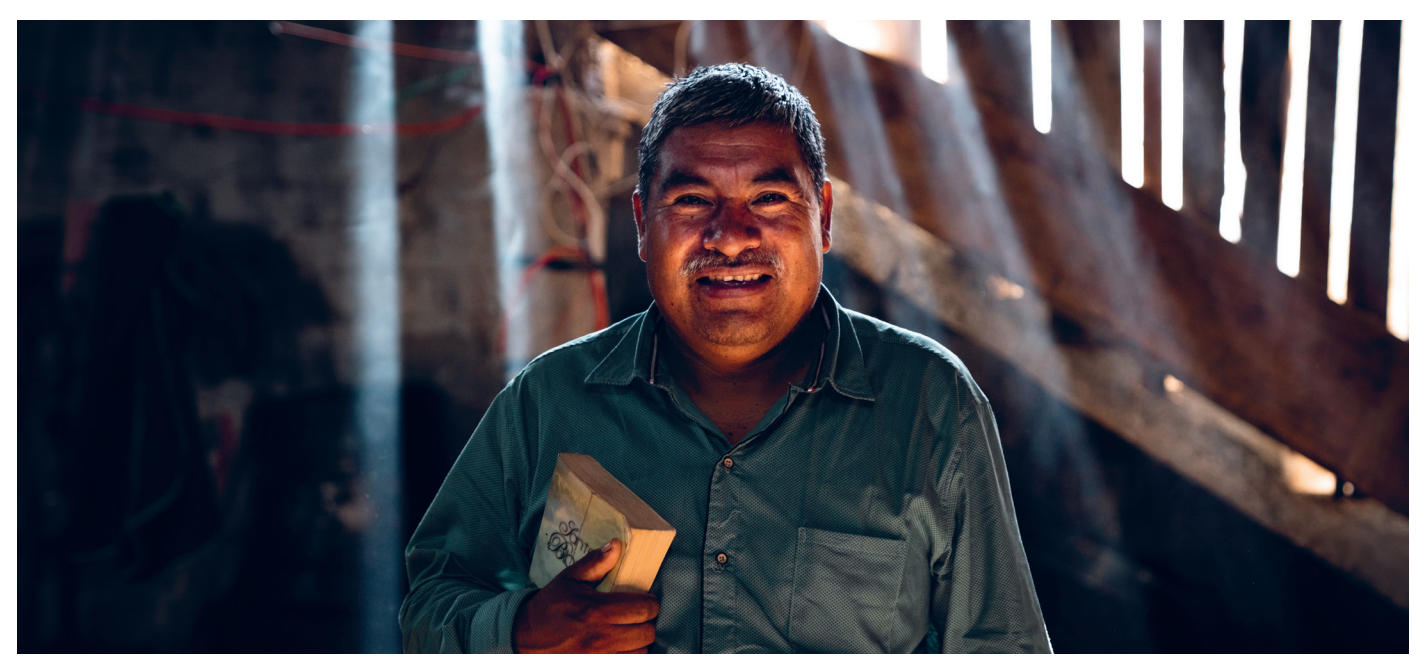
A pastor from Mexico.