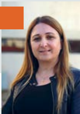
Iktimal, Centre of Hope, Latakia, Syria.